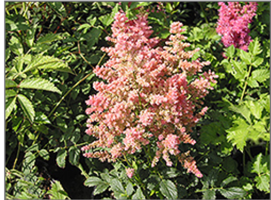
Country and Western Astilbe flowers