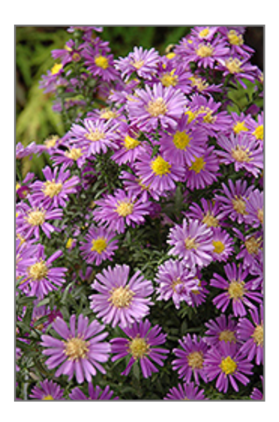
Celeste Aster flowers