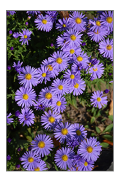
Sapphire Aster flowers