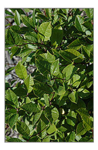
Jim Dandy Winterberry foliage