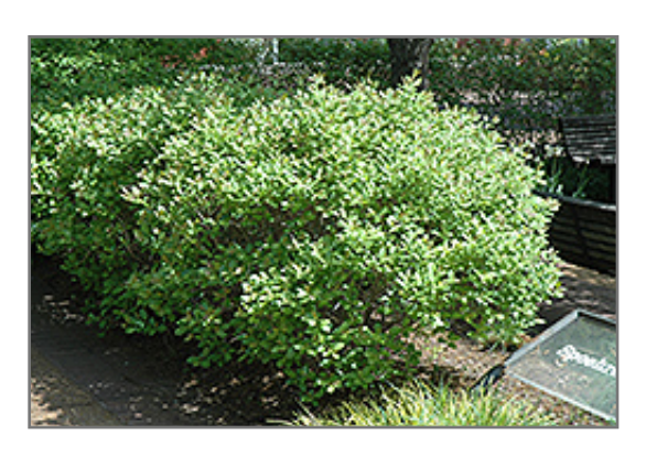
Jim Dandy Winterberry

Jim Dandy Winterberry is recommended for the following landscape applications;