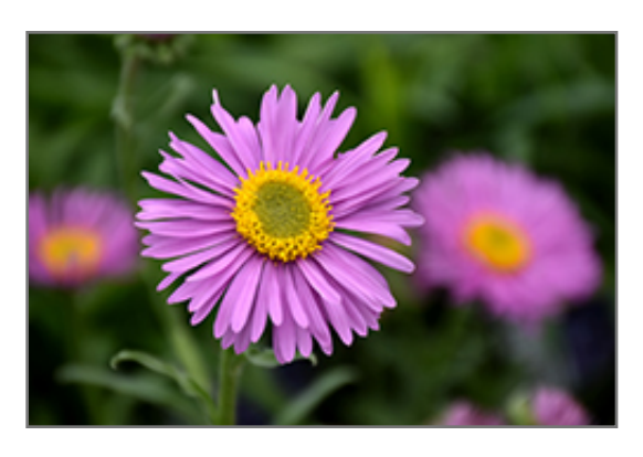
Happy End Alpine Aster flowers

Compact, spreading habit; profusion of rose-pink flowers and attractive lance-like green leaves; prefers cool, moist soil; water the root zone instead of from the top to reduce fungal disease; water regularly to encourgage more blooms