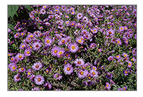
Woods Purple Aster flowers