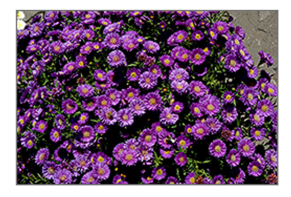
Magic Aster flowers