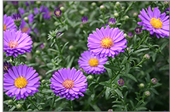
Days Aster flowers