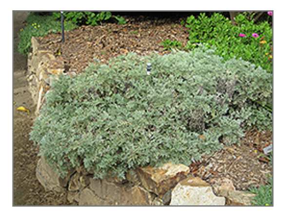
Powis Castle Artemesia

Powis Castle Artemesia will grow to be about 3 feet tall at maturity, with a spread of 24 inches. Its foliage tends to remain dense right to the ground, not requiring facer plants in front. It grows at a fast rate, and under ideal conditions can be expected to live for approximately 10 years. As an herbaceous perennial, this plant will usually die back to the crown each winter, and will regrow from the base each spring. Be careful not to disturb the crown in late winter when it may not be readily seen!