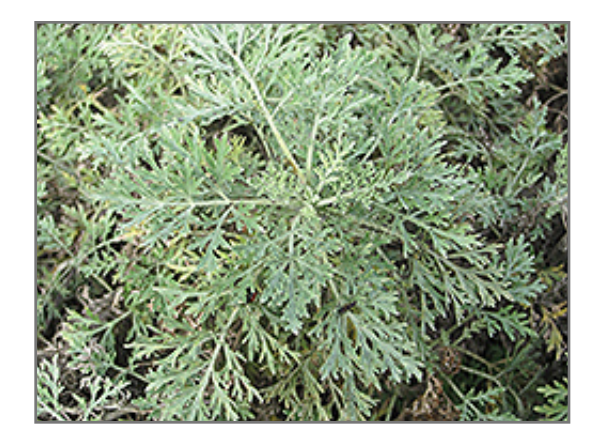
Powis Castle Artemesia foliage