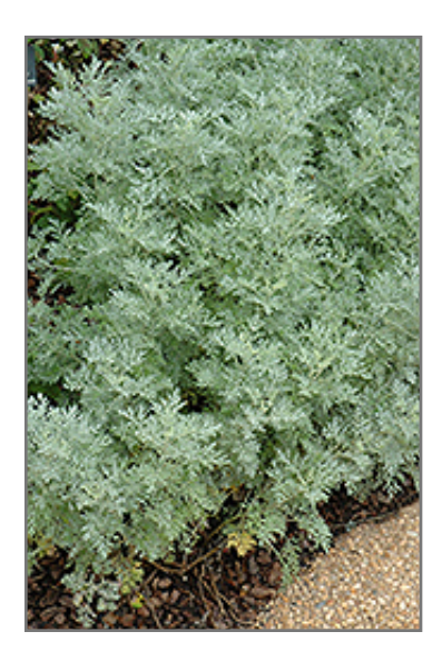
Powis Castle Artemesia