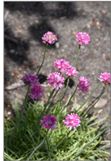
Nifty Thrifty Sea Thrift flowers