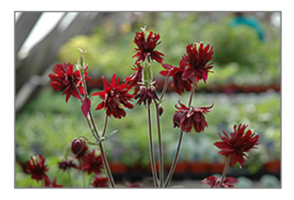
Ruby Port Double Columbine flowers