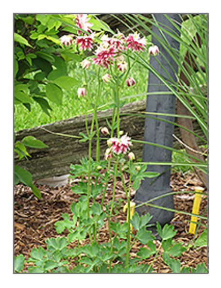
Nora Barlow Columbine in bloom