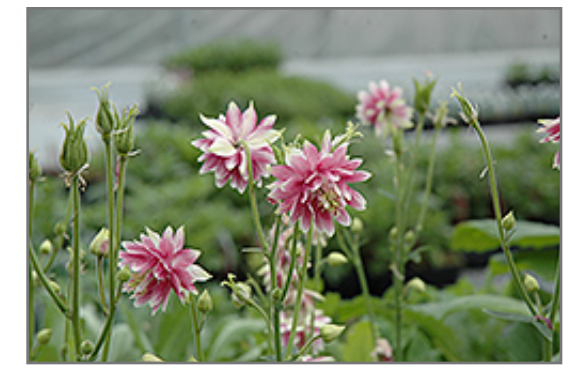
Nora Barlow Columbine flowers

This is a relatively low maintenance plant, and should be cut back in late fall in preparation for winter. Deer don't particularly care for this plant and will usually leave it alone in favor of tastier treats. Gardeners should be aware of the following characteristic(s) that may warrant special consideration;