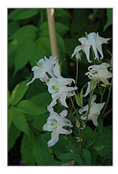
Mellow Yellow Columbine flowers

Pretty creamy-white flowers float atop clean green foliage in spring on this adorable garden gem, flowers have long spurs that command attention; tolerates dry shade