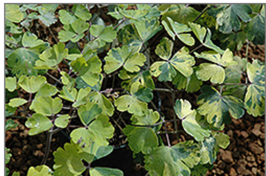
Leprechaun Gold Columbine foliage