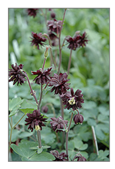
Black Barlow Columbine flowers

Exotic, dark purple (nearly-black) double flowers, the small spurless flowers are pompom shaped and resemble a small dahlia; this plant doesn't like to be disturbed so try spreading seed instead of dividing