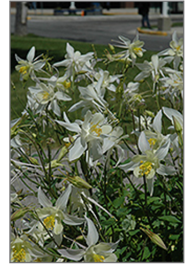
Biedermeier White Columbine flowers

This relatively compact columbine fits in tight spots, perfect for rock gardens; lacy foliage and unique spurred bright white flowers brighten shady areas