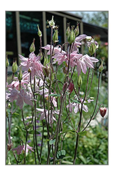
Apple Blossom Columbine flowers