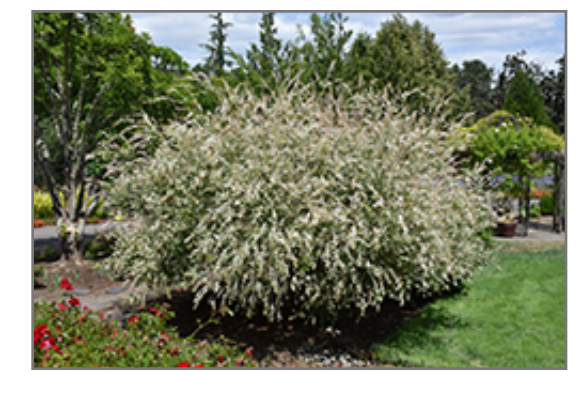
Tricolor Willow

One of the showiest of shrubs for foliage color, new growth emerges soft pink and white, literally bathing the plant with color in spring, fades to white variegation in summer; should be pruned every winter for maximum effect; tough and adaptable