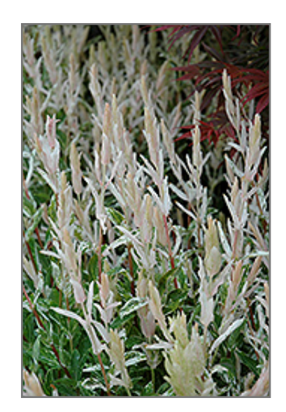
Tricolor Willow foliage

Tricolor Willow is recommended for the following landscape applications;