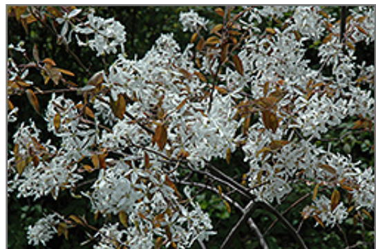
Dwarf Serviceberry flowers