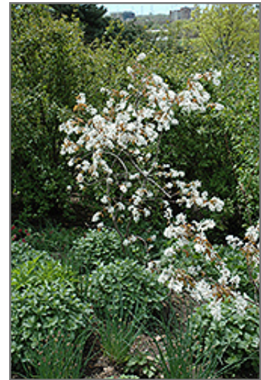
Dwarf Serviceberry in bloom

Dwarf Serviceberry is recommended for the following landscape applications;