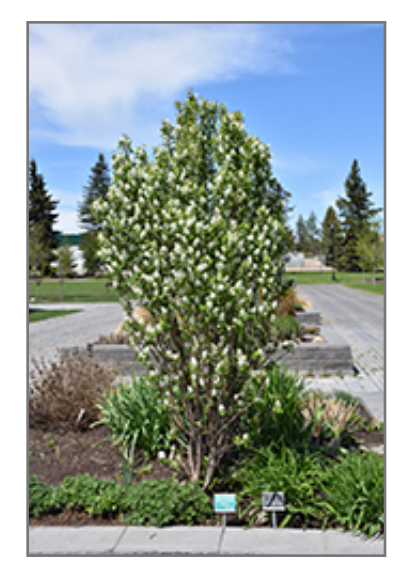
Standing Ovation Saskatoon Berry in bloom