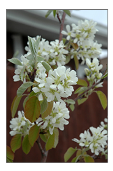
Standing Ovation Saskatoon Berry flowers