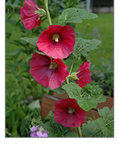
Red Hollyhock flowers

Giant crimson-red flowers on towering spikes, this biennial is tolerant to the natural toxin formed by the roots of Black Walnut, but can be susceptible to Japanese beetles; plant in full sun for better growth