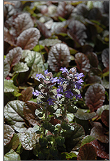
Purple Brocade Bugleweed flowers

Purple Brocade Bugleweed is recommended for the following landscape applications;