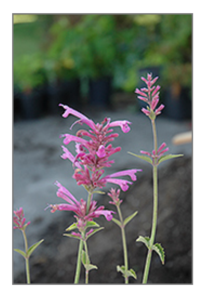
Tutti Frutti Hyssop flowers

Easy-to-care for perennial provides late-season color; fuchsia flowers on airy spikes add lovely texture to any garden; a favorite for native butterflies and hummingbirds; soothing, aromatic, licorice scented foliage for the fragrant garden