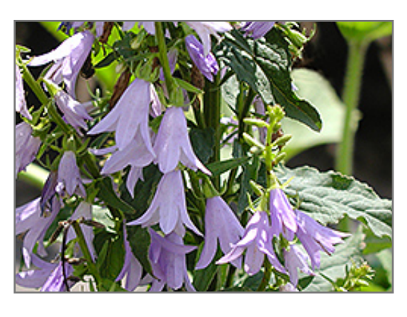
Amethyst Ladybells flowers