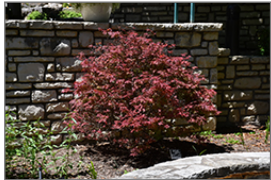
Shaina Japanese Maple

Shaina Japanese Maple is recommended for the following landscape applications;