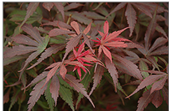
Shaina Japanese Maple foliage