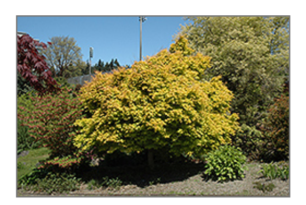
Katsura Japanese Maple

Katsura Japanese Maple is recommended for the following landscape applications;