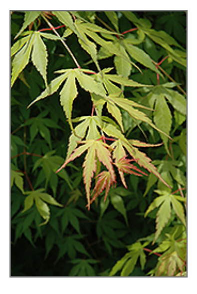
Katsura Japanese Maple foliage

This is a relatively low maintenance tree, and should only be pruned in summer after the leaves have fully developed, as it may 'bleed' sap if pruned in late winter or early spring. It has no significant negative characteristics.