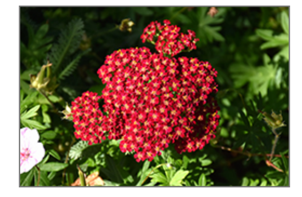
Red Velvet Yarrow flowers

An outstanding varrow from the Netherlands, this hardy plant has dark rosy red flowers that refuse to fade; prefers to be planted in infertile soil and perfect for xeriscapes