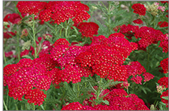
Pomegranate Yarrow flowers