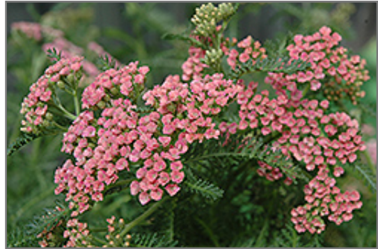
Gloria Jean Yarrow flowers