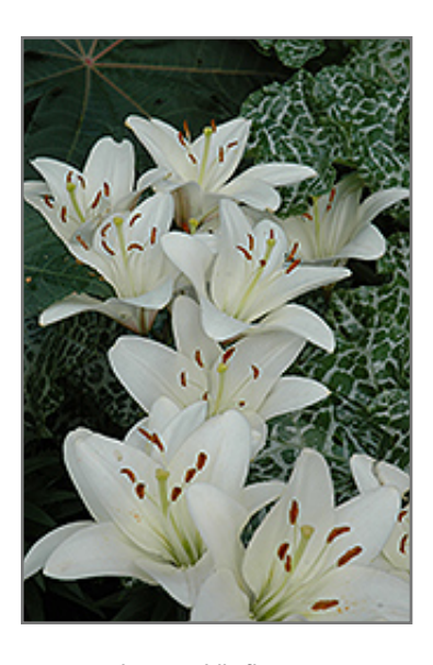
Lennox Lily flowers

Very clean white flowers with none of the typical spots on the petals, chocoloate anthers; petals are slightly recurved; excellent choice for evening and moon gardens