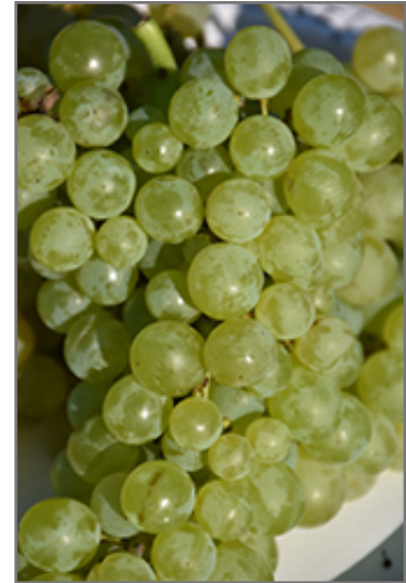
Himrod Grape fruit