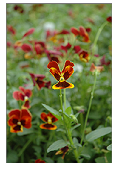
Arkwright Ruby Pansy flowers

Arkwright Ruby Pansy has masses of beautiful antique red flowers with yellow eyes and deep purple centers at the ends of the stems from early spring to late fall, which are most effective when planted in groupings. Its crinkled round leaves remain green in colour throughout the season.