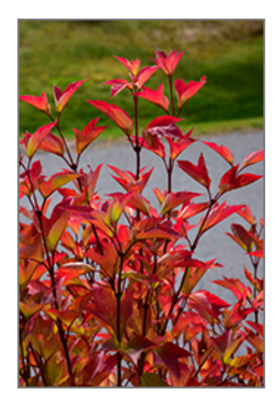
Redwing Highbush Cranberry in fall

This shrub does best in full sun to partial shade. It prefers to grow in average to moist conditions, and shouldn't be allowed to dry out. It is not particular as to soil type or pH. It is highly tolerant of urban pollution and will even thrive in inner city environments. This is a selection of a native North American species.