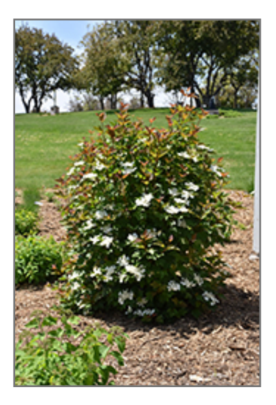
Redwing Highbush Cranberry in bloom