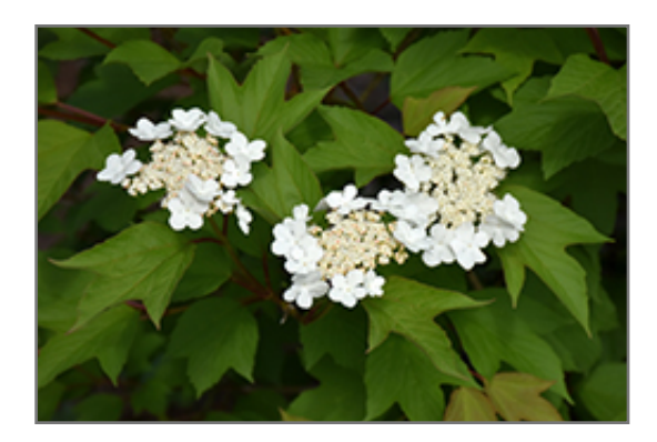
Redwing Highbush Cranberry flowers

Redwing Highbush Cranberry is a dense multi-stemmed deciduous shrub with an upright spreading habit of growth. Its average texture blends into the landscape, but can be balanced by one or two finer or coarser trees or shrubs for an effective composition.