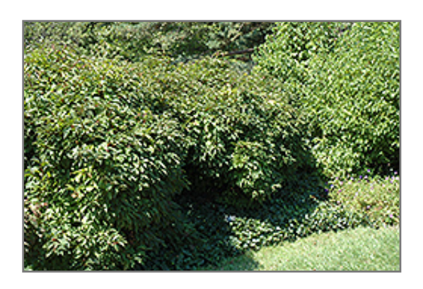
Dwarf Fragrant Viburnum

This is a relatively low maintenance shrub, and should only be pruned after flowering to avoid removing any of the current season's flowers. It is a good choice for attracting birds to your yard, but is not particularly attractive to deer who tend to leave it alone in favor of tastier treats. It has no significant negative characteristics.