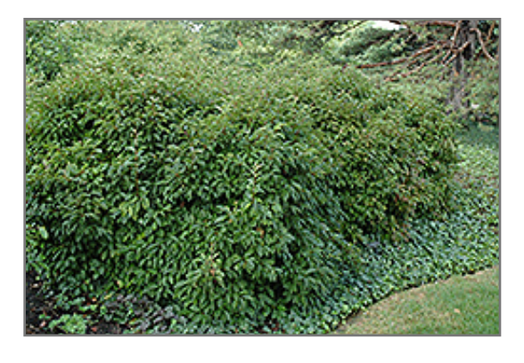
Dwarf Fragrant Viburnum

Dwarf Fragrant Viburnum is a dense multi-stemmed deciduous shrub with a mounded form. Its average texture blends into the landscape, but can be balanced by one or two finer or coarser trees or shrubs for an effective composition.