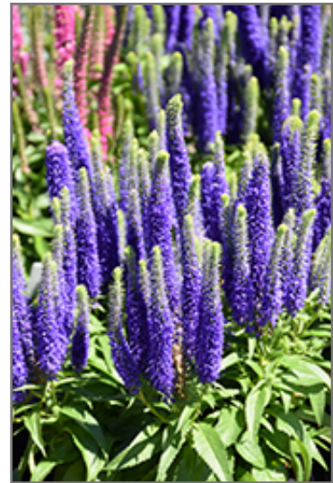
Royal Candles Speedwell flowers