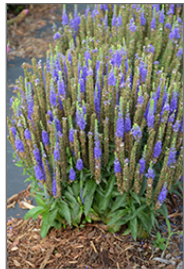
Royal Candles Speedwell in bloom