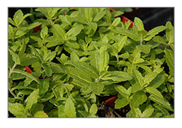
Aztec Gold Creeping Speedwell foliage

This is a relatively low maintenance plant, and should only be pruned after flowering to avoid removing any of the current season's flowers. It is a good choice for attracting butterflies to your yard, but is not particularly attractive to deer who tend to leave it alone in favor of tastier treats. It has no significant negative characteristics.