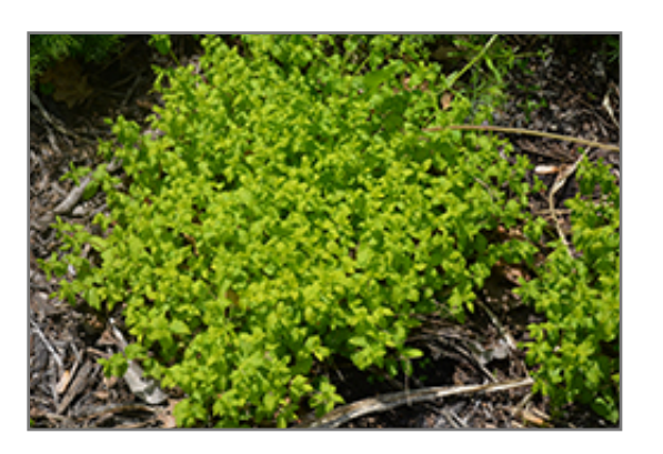
Aztec Gold Creeping Speedwell

Aztec Gold Creeping Speedwell is recommended for the following landscape applications;