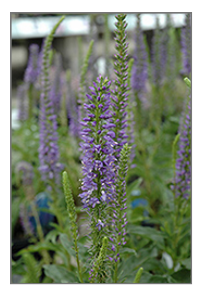
High Five Speedwell flowers

High Five Speedwell has masses of beautiful spikes of blue flowers rising above the foliage from mid summer to mid fall, which are most effective when planted in groupings. The flowers are excellent for cutting. Its serrated narrow leaves remain forest green in colour throughout the season.