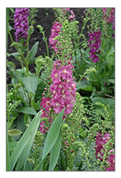
Rosetta Mullein flowers

Rosetta Mullein has masses of beautiful spikes of cherry red flowers with white anthers rising above the foliage from mid spring to mid summer, which are most effective when planted in groupings. The flowers are excellent for cutting. Its crinkled oval leaves remain dark green in colour throughout the season.