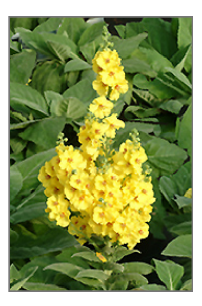
Lemon Sorbet Mullein flowers

Lemon Sorbet Mullein has masses of beautiful spikes of yellow flowers with antique red eyes rising above the foliage from mid spring to mid summer, which are most effective when planted in groupings. The flowers are excellent for cutting. Its oval leaves remain dark green in colour throughout the season.