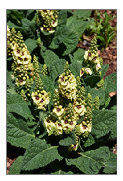
Dark Eyes Mullein flowers

Dark Eyes Mullein has masses of beautiful spikes of buttery yellow flowers with dark red eyes rising above the foliage from mid spring to mid summer, which are most effective when planted in groupings. The flowers are excellent for cutting. Its crinkled oval leaves remain grayish