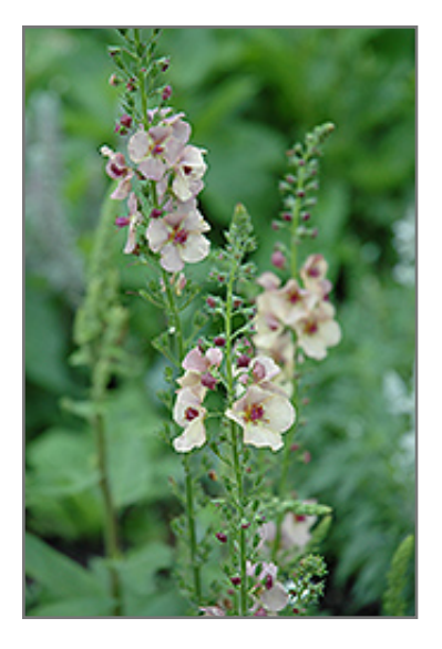
Apricot Sunset Mullein flowers

Apricot Sunset Mullein has masses of beautiful spikes of peach flowers with rose eyes and purple anthers rising above the foliage from mid spring to mid summer, which emerge from distinctive deep purple flower buds, and which are most effective when planted in groupings. The flowers are excellent for cutting. Its oval leaves remain dark green in colour throughout the season.