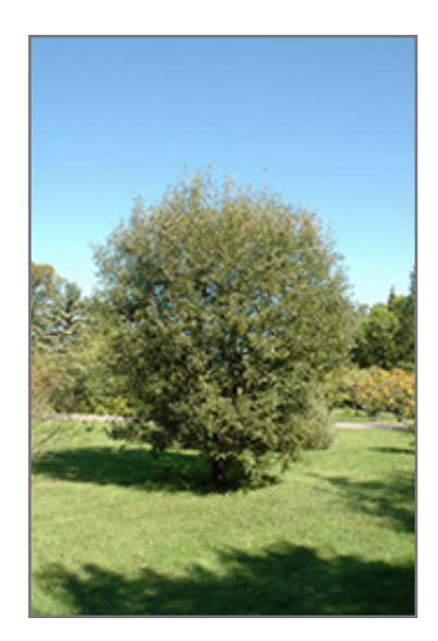
Pussy Willow