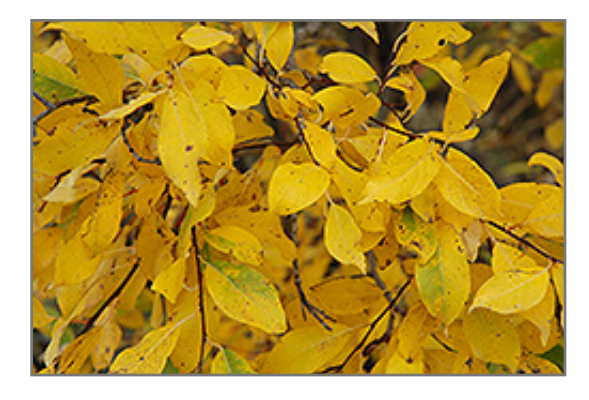
Pussy Willow in fall

This shrub does best in full sun to partial shade. It is quite adaptable, prefering to grow in average to wet conditions, and will even tolerate some standing water. It is not particular as to soil type or pH. It is somewhat tolerant of urban pollution. This species is native to parts of North America.