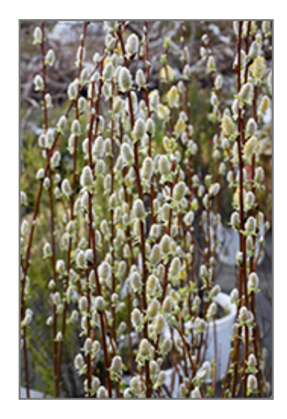
Pussy Willow flowers

Pussy Willow is recommended for the following landscape applications;