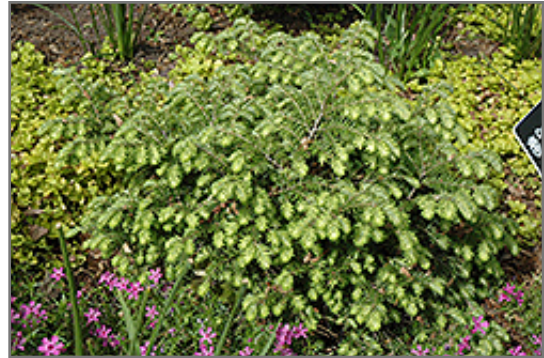
Moon Frost Hemlock

Moon Frost Hemlock is recommended for the following landscape applications;