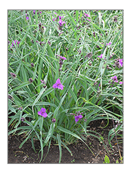
Concord Grape Spiderwort in bloom