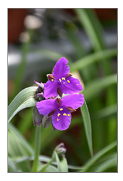
Concord Grape Spiderwort flowers