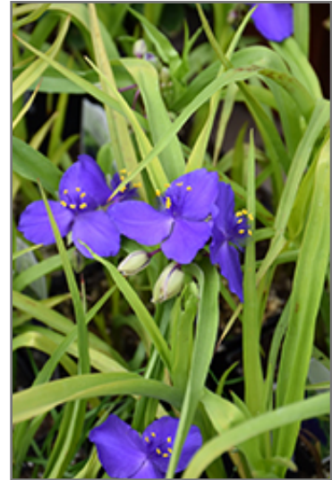
Blue And Gold Spiderwort flowers