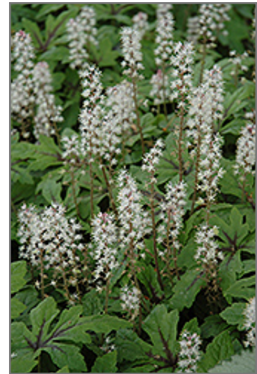
Stargazer Mercury Foamflower flowers