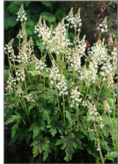
Sea Foam Foamflower flowers