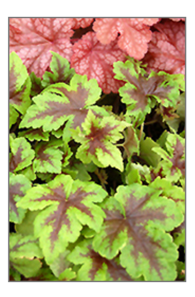
Neon Lights Foamflower foliage

Neon Lights Foamflower has masses of beautiful spikes of lightly-scented white bell-shaped flowers rising above the foliage from mid spring to mid summer, which are most effective when planted in groupings. The flowers are excellent for cutting. Its attractive deeply cut lobed leaves remain lime green in colour with distinctive black veins throughout the year. The dark red stems are very colorful and add to the overall interest of the plant.