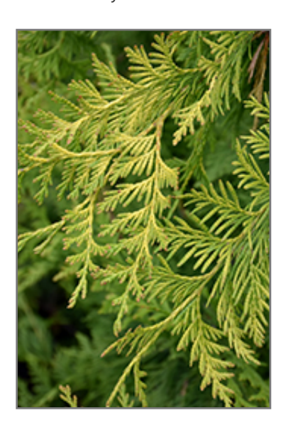
Sunshine Arborvitae foliage