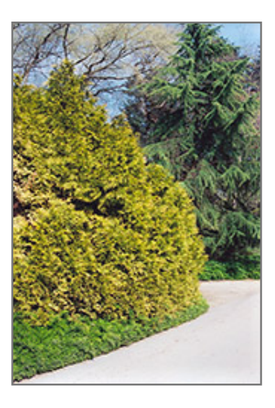
Sunshine Arborvitae