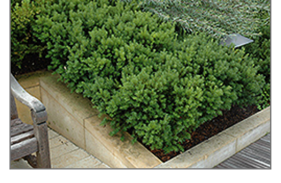
Dark Green Spreader Yew

Dark Green Spreader Yew will grow to be about 4 feet tall at maturity, with a spread of 6 feet. It tends to fill out right to the ground and therefore doesn't necessarily require facer plants in front. It grows at a slow rate, and under ideal conditions can be expected to live for 50 years or more.